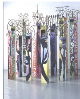
My Lord, What a Morning

They explore the origin of spirituals in Africa and in the fields of the American South during slavery and of their importance during the Civil War period. Students understand symbolism through the artist's use of the female form to represent a spiritual. They discuss pattern and texture in regard to both art and music and design music boxes that feature texture and pattern created with fabric, beads, buttons, and shells.